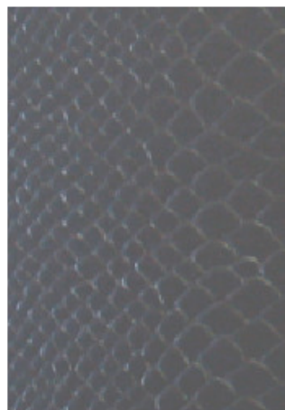
cobra plate embossing