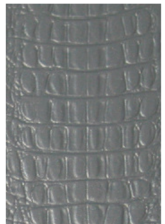
croco plate embossing