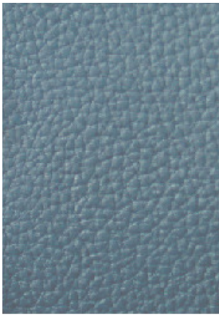
grain, fine collection

The rolls are 140 cm to 150 cm depending on thickness. Due to technical reasons not all textures can be supplied on rolls. The size of the plate is approx. 100 x 150 cm depending on texture.